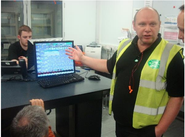
Modern standards at Robert Wiseman Dairies