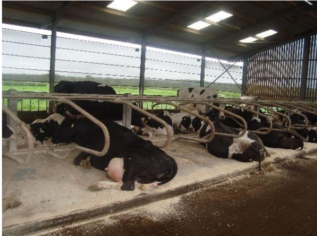
Waterbeds ensure optimal cow comfort