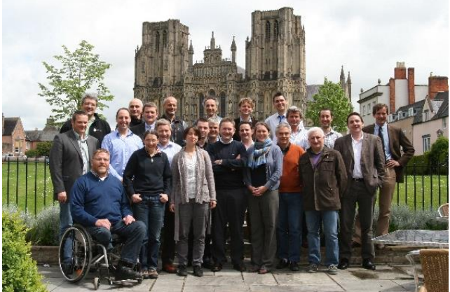
Members of the 5th European Mastitis Panel in the UK take time out on sharing best practice on mastitis control.

Watch the views from the leading mastitis experts at <u>www.studiobovine.com</u>.